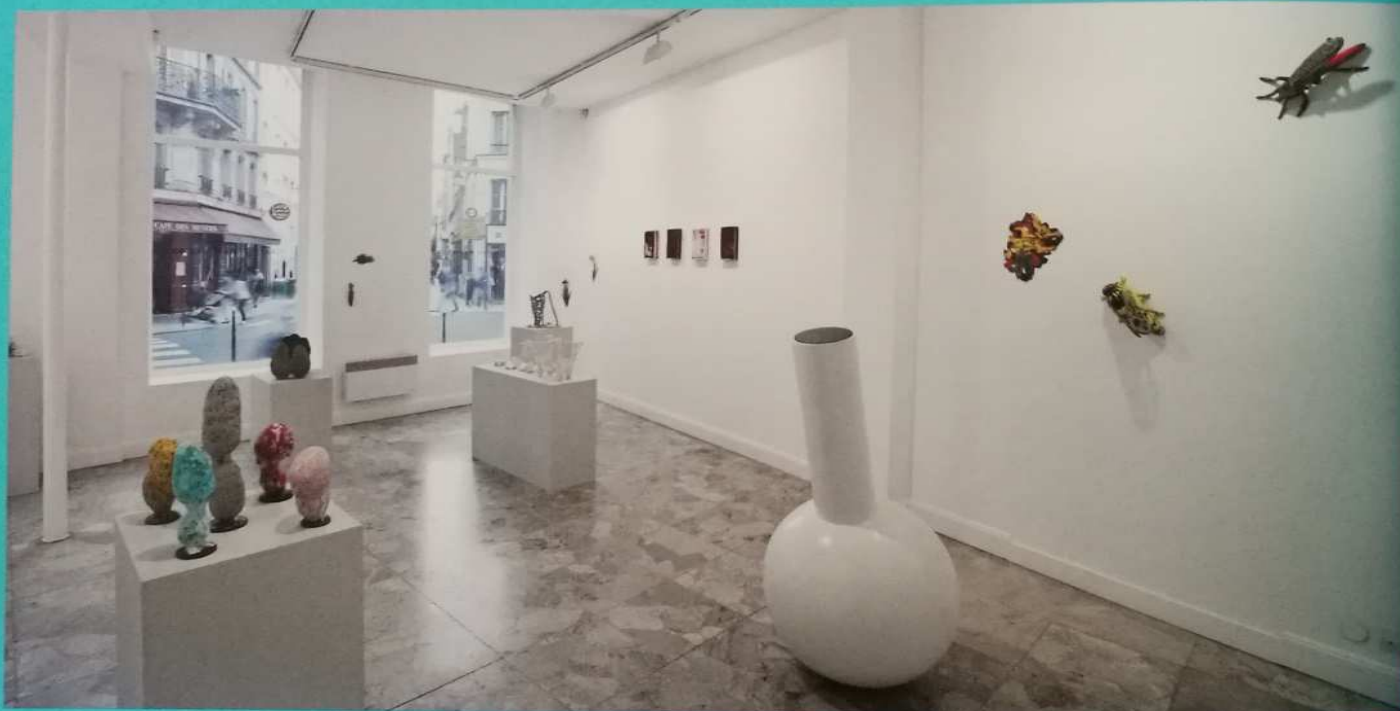
TERRES – Copenhagen Ceramics Invites – at Galerie Maria Lund, Paris 2013